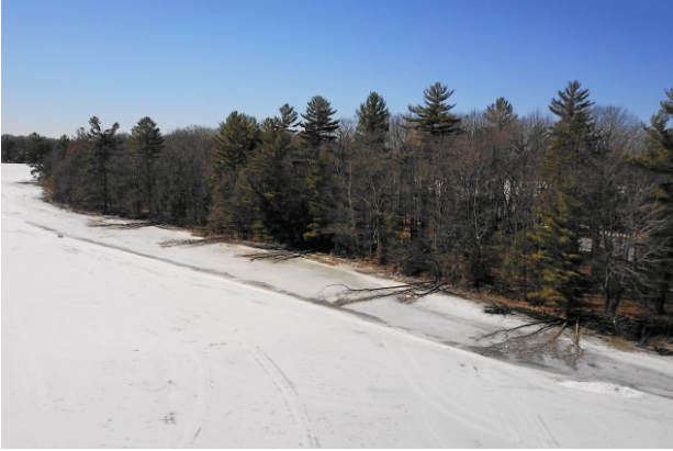
Five fish stick tree clusters along the southeast shoreline of Anthony Island.

A total of 41 fish sticks were created this winter along southern Lucerne shorelines by LLAA volunteers and Ken Mihalko utilizing his skid steer. Two additional fish sticks have been built along the northern Lucerne shoreline.